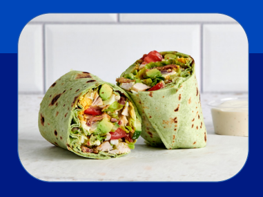
Grab + Go Meals and Beverages

This fall, we're offering lots of tasty options to choose each day!